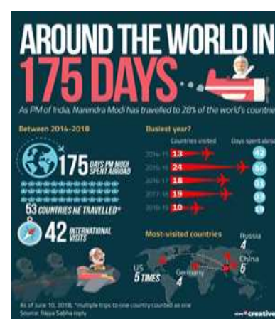
Figure 1. Modi's Frequent Foreign Trips

high-level interactions with China, Japan, ASEAN countries, and Australia. 37 Not only in his first year in office, 'Act East' policy has continued to be Modi's well-known style of engaging with other countries in the following years. Hindustan Times wrote that the 'Act East' policy has set a new benchmark of diplomacy, marking a new and more active foreign policy of India. 38