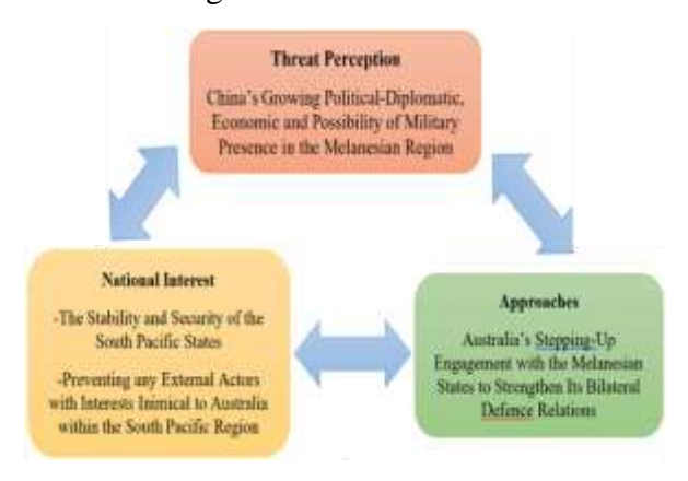
Figure 2: Australia's Triangle of Threat Perception toward Rise of China

between threat perceptions, values or national interests, and approaches of any particular states. Furthermore, the linkage between threat perception, values or national interest, and approaches called as the Triangle of Threat Perception on how those three concepts influence one another. In the case of Australia's threat perception to the rise of China in the South Pacific, the linkage between the three variables can be seen in the figure below: